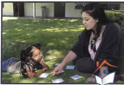
Come Read with Me