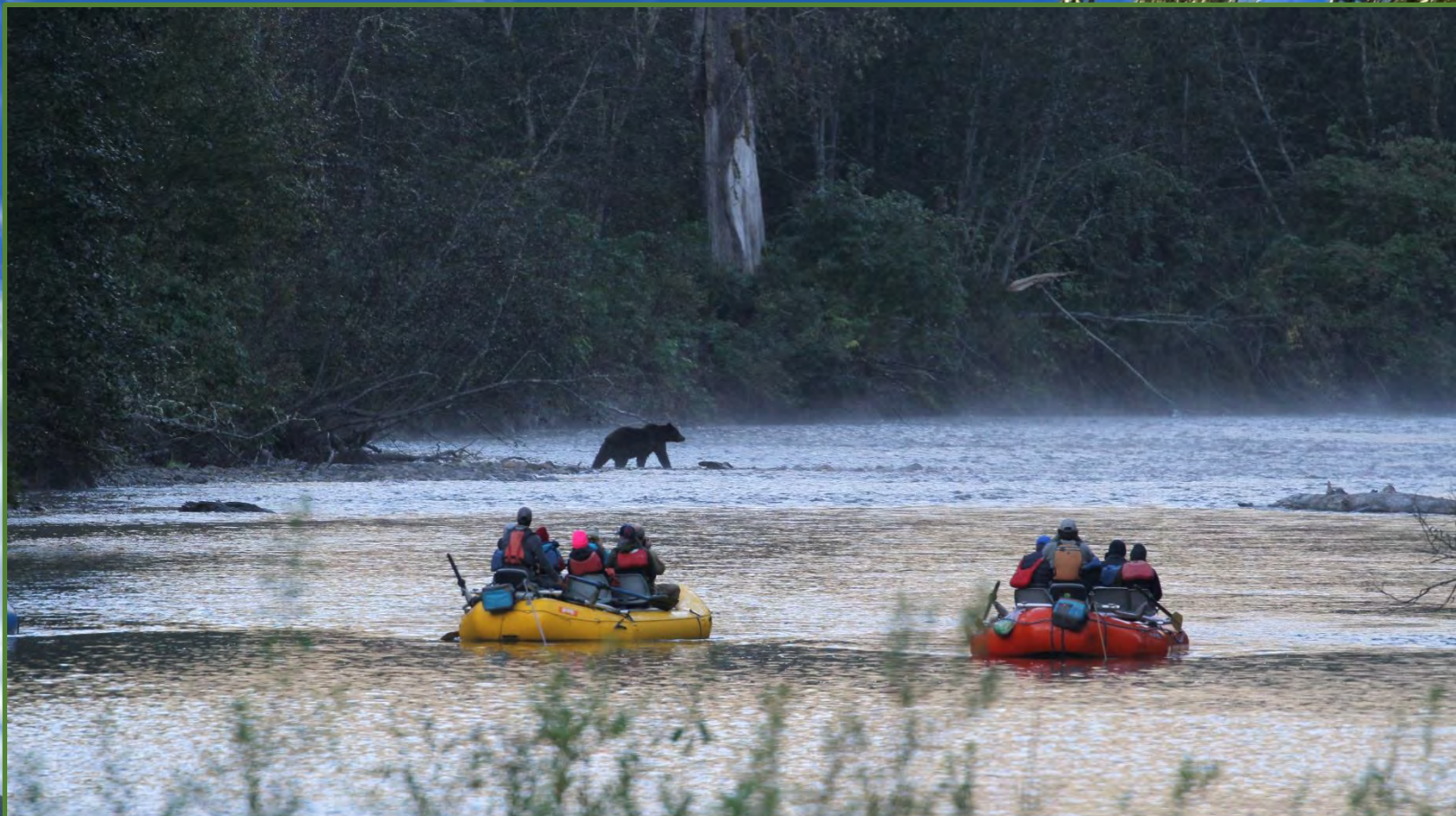
The next morning there was quite a bit of demand to stop at the bear platform again on the way out so we stopped for an hour. A distant bear was seen and photographed above. Several companies offer drift tours to photographers to get even closer to the bears there. This picture was taken from the viewing platform looking down river at a couple of very fortunate drift boats. Photos below show fall colours on the Chilcotin Plateau on the way home. The bridge over the Fraser River just west of William's Lake signals the return to civilization on the return trip.