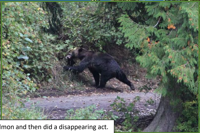
The single Grizzly Bear that caught a salmon and then did a disappearing act. Our Accommodation (photo taken on the previous trip)