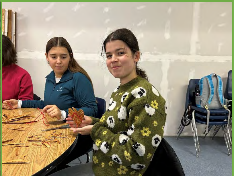
After cedar bark weaving, we were treated to a fantastic supper of Coho Salmon and various salads. The Coho Salmon had been cooked in the smokehouse we had visited the previous day.