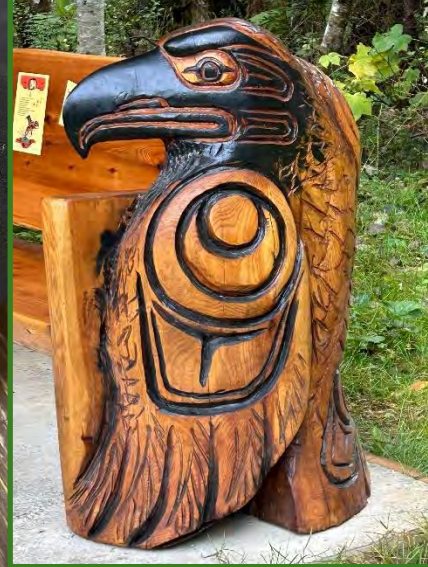
Bella Coola Trip Sept. 27-30, 2024 SD73 International Student Program