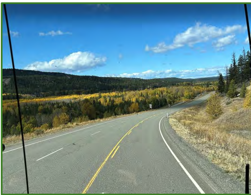
Fall colours on the drive

A large group of international students and chaperones left Kamloops at 7:00am on September 27, 2024. Our charter bus headed west with the final destination being Bella Coola. We had a 45 minute stop in Williams Lake for groceries and supplies and then turned onto Highway 20 and across the Chilcotin Plateau. We pulled into the Belarko Bear Viewing Platform at 4:15pm. After staying for 1.5 hours and not seeing a bear, we completed the last 50 minutes of our drive to our accommodations in Bella Coola. We saw 2 Black Bears on the drive in.