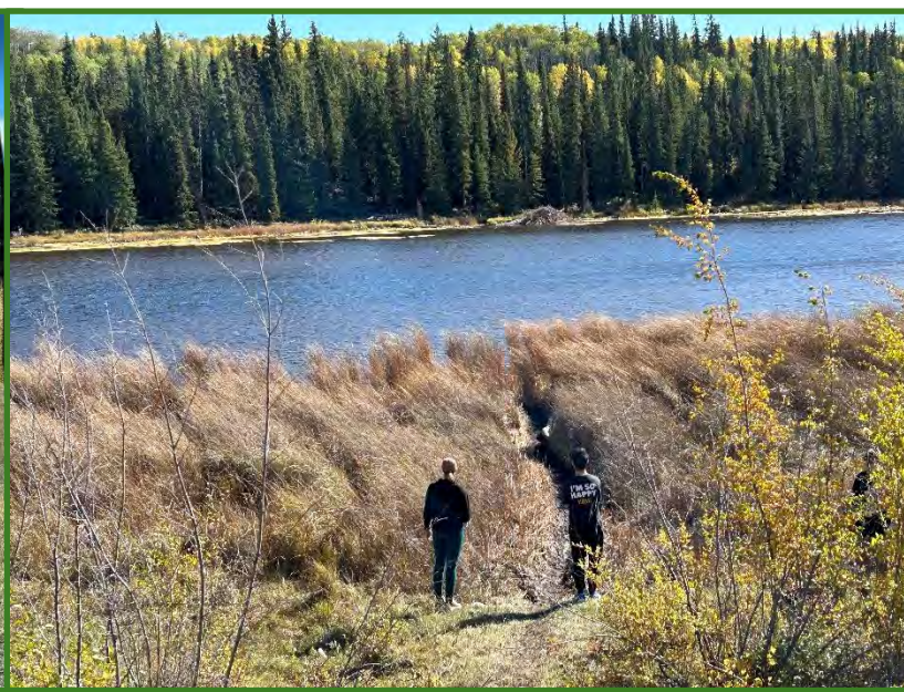
Checking out Beaver signs at a rest area

The next morning we left our accommodations at 8:30 and drove the short distance to meet with Hereditary Chief Noel Pootlass. Noel guided our walk up to a Nuxhalk sacred sight where ancient petroglyphs can be seen carved into rock. With his interpretation, the students were able to understand some of the significance of the carvings as well as other important Nuxhalk cultural areas and medicine. The group is pictured with Noel below.