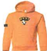
Gildan Youth Heavy Blend Hooded Sweatshirt