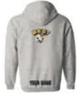
Gildan Heavy Blend™ Full-Zip Hooded Sweatshirt