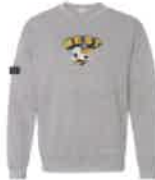
Gildan Heavy Blend™ Crewneck Sweatshirt