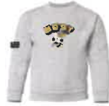
Youth Heavy Blend™ Crewneck Sweatshirt