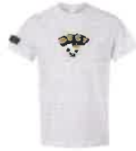
Gildan Youth Heavy Cotton 100% Cotton T-Shirt