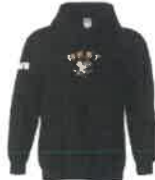
Gildan Heavy Blend™ Hooded Sweatshirt