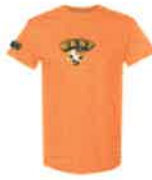
Gildan Heavy Cotton™ T-Shirt