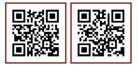
Primary Slide Deck Intermediate/Secondary Slide Deck