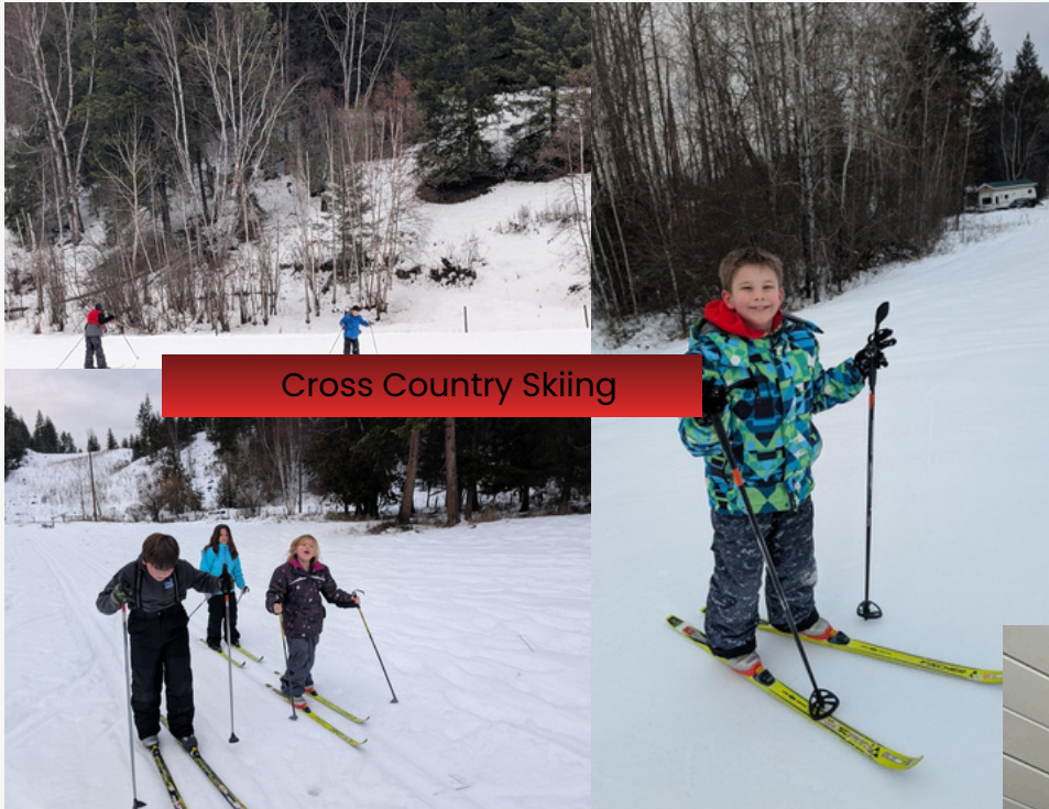
Cross Country Skiing