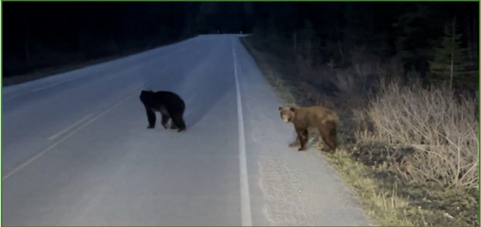
That night we drove the Bow Valley Parkway back to Lake Louise at dusk and saw several more Black Bears and another Moose. The next morning we drove the short distance to Lake Louise and enjoyed just under an hour at this famous lake. It was still mostly frozen but the near shore was thawed.