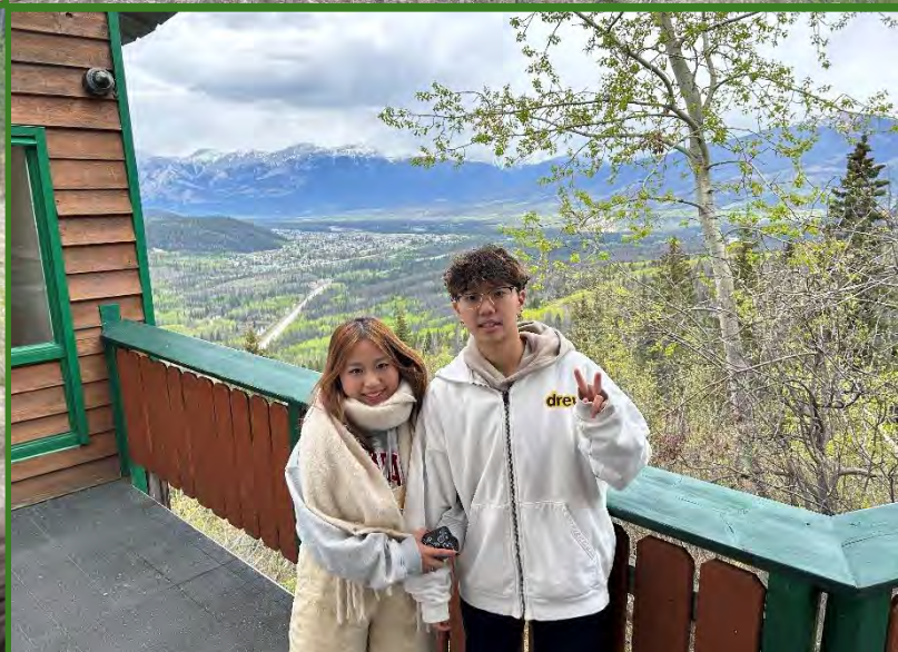
Sky Tram photos below