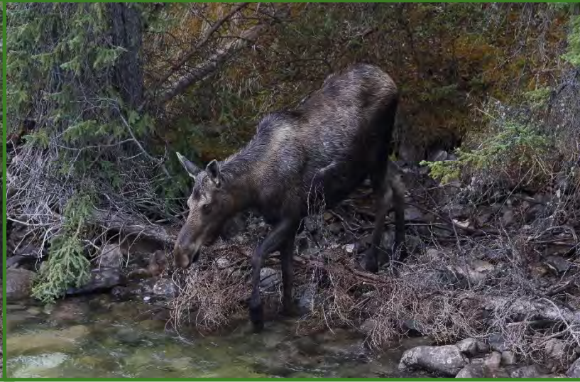
Back at the hostel at 10:00pm, we had some smores quickly over the fire before bed. A mother Elk and her very new calf walked into the area where we were at and began to eat grass very near to us. We kept an eye on that, knowing how dangerous that could be if the mother felt threatened by us at all.