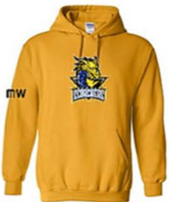
Gildan Heavy Blend™ Hooded Sweatshirt