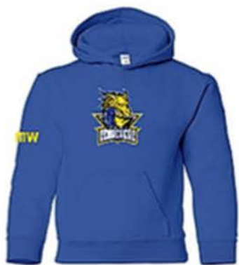
Gildan Youth Heavy Blend Hooded Sweatshirt

Click here to shop or find more details.