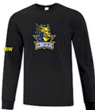
ATC Adult Everyday Cotton Long Sleeve Tee