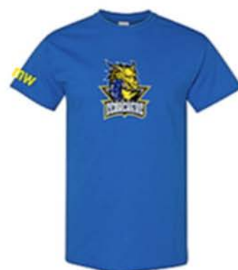
Gildan Heavy Cotton™ T-Shirt