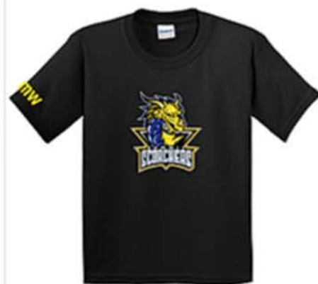
Gildan Youth Heavy Cotton 100% Cotton T-Shirt