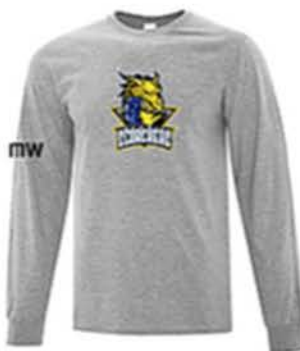
ATC Youth Everyday Cotton Long Sleeve Tee