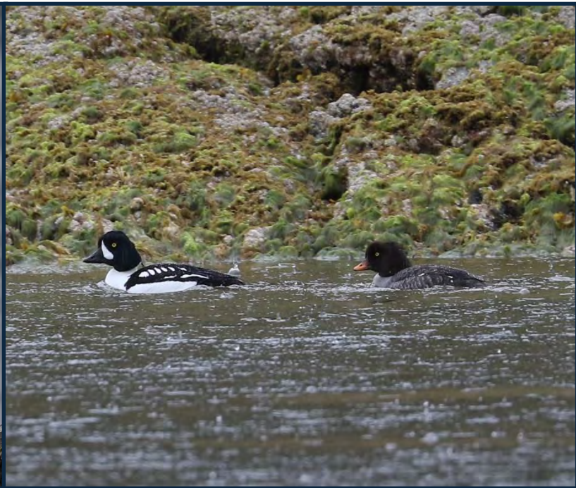
From top left: Bald Eagle, Barrow's Goldeneye, Black Bear, Harbour Porpoise, Black Bears