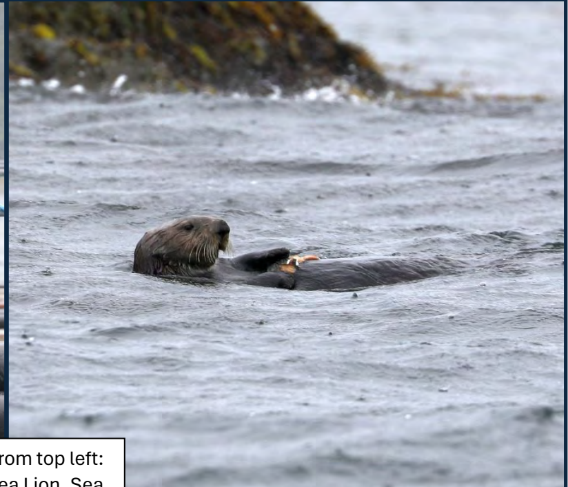
Clockwise from top left: California Sea Lion, Sea Otter, Gray Whale