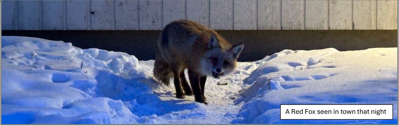
A Red Fox seen in town that night